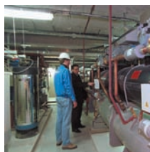
2 Engineering Facilities