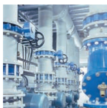
5 Mechanical & Electrical