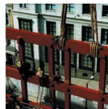
4 Health & Safety