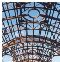
7 Structural Engineering