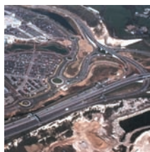
1 Civil & Transportation

Waterman Group offers a multi-disciplinary engineering and environmental consultancy service to clients. Please contact us for more information on our full range of services: