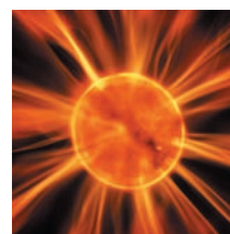
8 Sustainable Energy